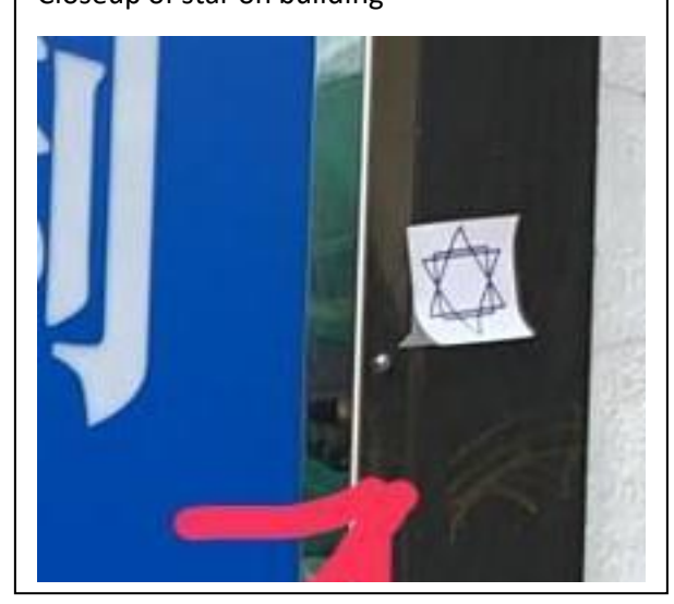
Closeup of star on building