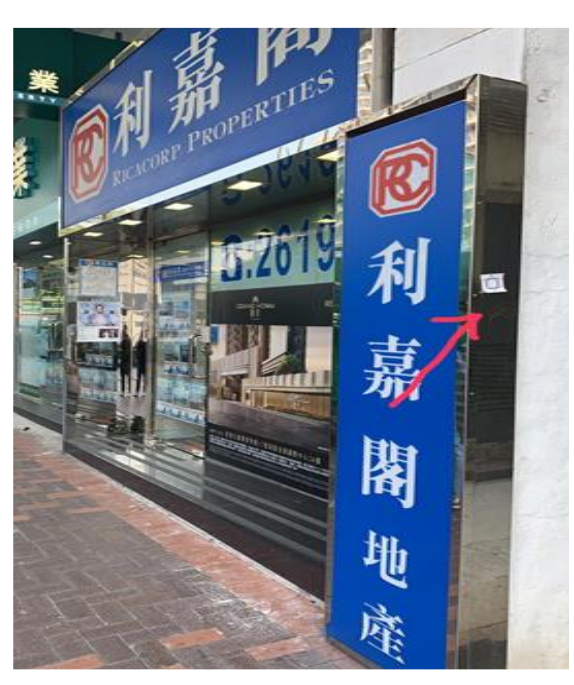
One of saved buildings with modified Star of David