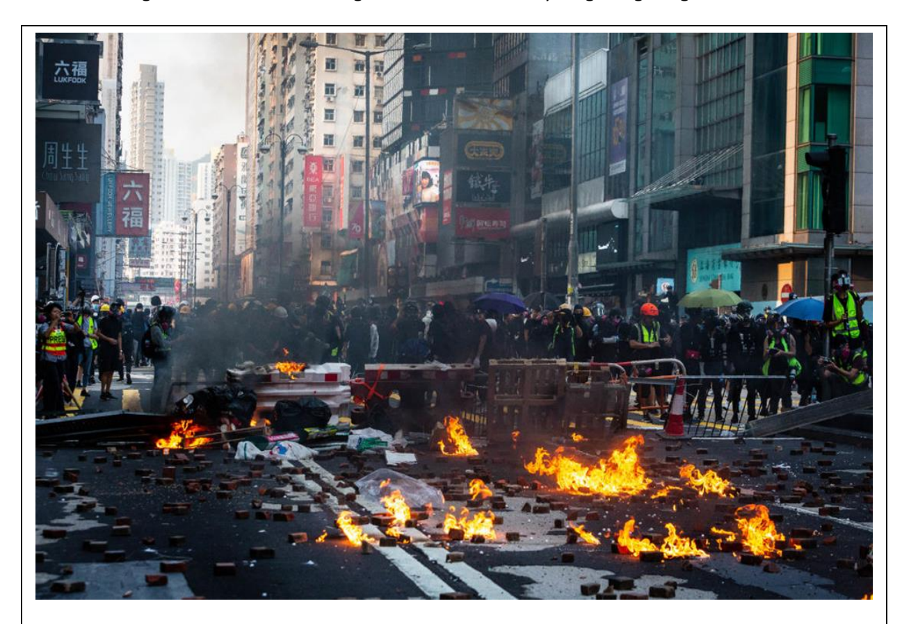
Violence has been terribly destructive.

Likewise for arguments that the Taiwan government has taken young Hong Kong men to Taiwan for