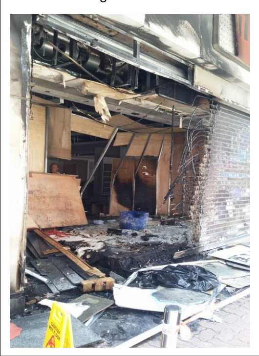
Trashed buildings had no star.